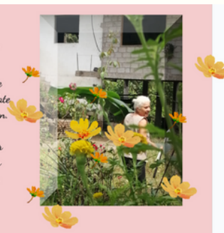
*Sample of student work*

When I think about the happiest moment of my life, I remember the oddest things, the sweet life of a child without worries. How my grandpa's yard smelt and the milked milk tasted. How my cousin and I made chocolate cookies with mud and leaves from my grandma's garden. The sound of dirty clothes washing and my grandma angry. How the hens running somewhere, how the river sounded. The feeling of peace and freedom. I remember the moments that will be captured as momeries forever.